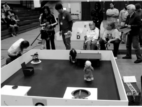
Figure 1: A. 2009 RoboWaiter arena.