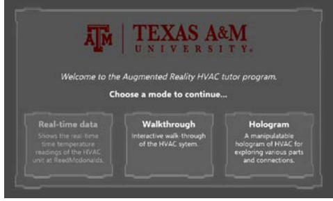
Fig. 3. Application Home Menu