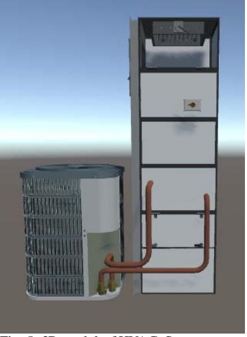
Fig. 5. 3D model of HVAC System

The hologram mode provides a 3D model of the HVAC system along with various tools that the user can use to manipulate the model, which is seen in Fig. 5. The 3D model displayed is as seen in the Unity 3D window on the computer. When the user sees the model on HoloLens, the model would be superimposed on his surroundings.