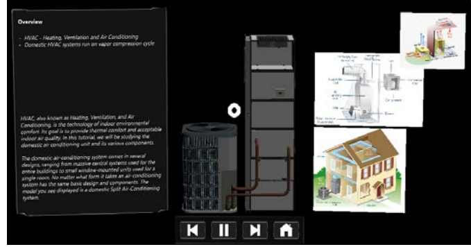
Fig. 4. Walkthrough Mode

The walkthrough mode is a voice-guided tutorial that teaches the basics of an HVAC system. There are 3 distinct windows in this mode. The first window on the left displays the description of the current component, the middle window has a 3D hologram of the component being discussed, and the window on the right displays relevant images that give additional information about the component, as seen in Fig. 4.