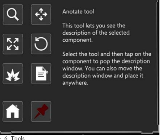
Fig. 6. Tools