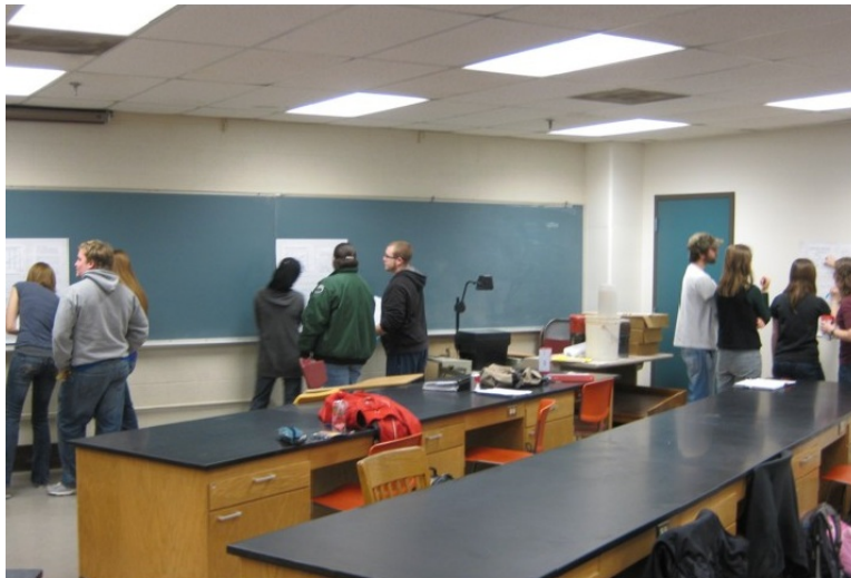
Figure 1: Snapshot from one of the Gallery Walks showing the different collaborative groups working different problems.

Gallery Walks create a dynamic learning environment, yet one that is transient because at the end of the class the momentum evaporates and everyone leaves. Did the students have enough time to fully appreciate each problem, beyond the five minutes they spent on it? To what extent will they retain information for the problem their group summarized, in comparison to all other problems they faced? How can the information contained on each of the Post-it notes be made readily accessible to students after the exercise ends? To mitigate these concerns, the active learning environment created by the Gallery Walk was extended beyond the classroom with the implementation of a course Wiki.